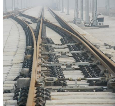
► Slab track

► Turnouts for laying on ballasted or concrete slab track